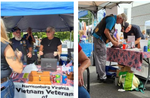
Chapter members working at Broadway's Fall Festival

Happy Anniversary To Those Celebrating in October!