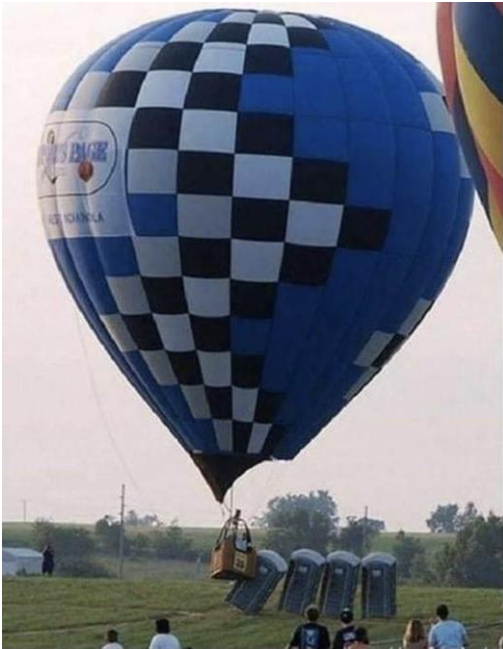
No one was killed, but it probably scared the crap out of them.

One can only imagine the horror of the occupants inside those buildings.