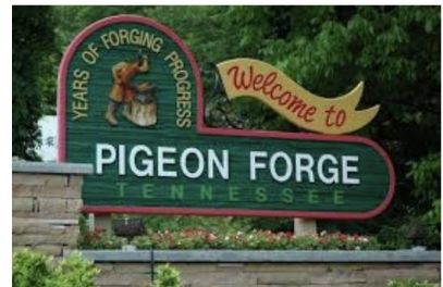
Fun Place to Visit!