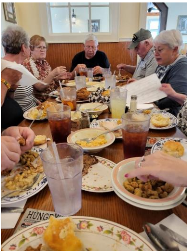
Pass the chicken, the biscuits... Just pass it all – Yum!

A great time and wonderful fellowship was had by all. What happens in Pigeon Forge stays in Pigeon Forge until the next adventure.....Rosie?????