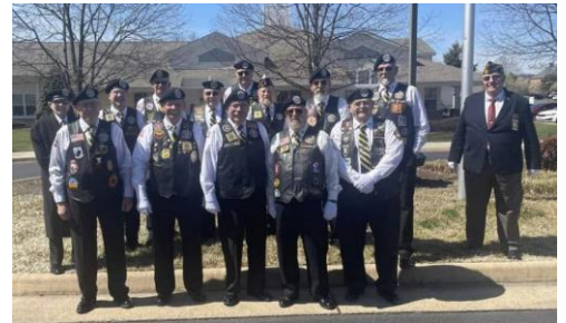
Chapter 1061 Honor Guard at Brookdale