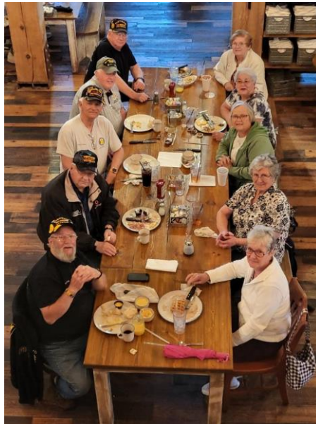
Great Meal at Five Oaks Farm Kitchen