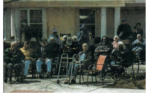
Residents of the Brookdale Senior Living Center watch as Chapter 1061 of the VVA exchanges the old flag for the new one.

The old flag has been handed off to the American Legion in Harrisburg to be disposed of with dignity and honor, as required by the U. S. Flag Code. Debate about Vietnam has been rampant since its inception and will probably continue until 100 years have passed and those who lived it have passed on. However, as Stephen Decatur said, "Our country! In her intercourse with foreign nations may she always be in the right, but our country, right or wrong."