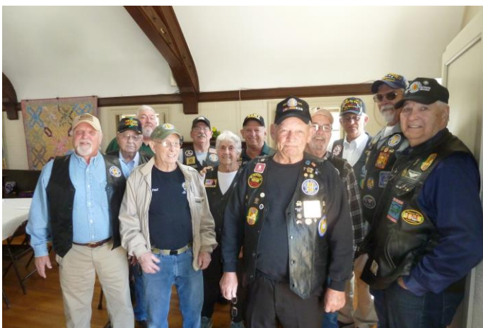
The Band of Brothers and One Sister