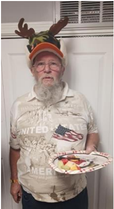
The Reindeer hat